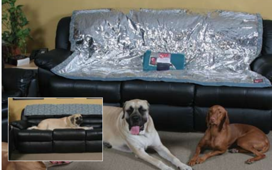
The dual-sided furniture throw from PetzOff keeps pets off the couch when its dog-detering side is exposed but looks good when its decorative side is revealed, as in the inset photo.

For kitties, PetSafe’s SSSCat is helpful for such things as keeping cats off tables and countertops and out of plants, and discouraging furniture scratching. Filled with compressed gas, the unit