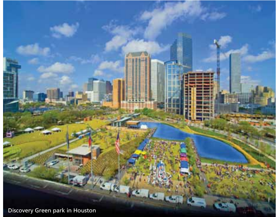
Discovery Green park in Houston

With floor-to-ceiling windows revealing dramatic views of the city's downtown skyline, the third-floor Nautilus Ballroom at Houston's Downtown Aquarium dining and entertainment complex has a 6,000-sq.-ft. function space that accommodates up to 600 guests. The space has a wrap-around private balcony and cylindrical foyer aquarium, as well as audiovisual services for events. The six-acre downtown complex is a 500,000-gallon aquatic wonderland with a variety of exhibits that house more than 200 species of aquatic life from around the globe. aquariumrestaurants.com/downtownaquariumhouston