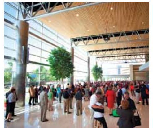
Left: Organ Mountains in New Mexico. Above, from top: Hot air balloons in Albuquerque, N.M.; traditional Southwest architecture in New Mexico; and the Tulsa Convention Center in Oklahoma .