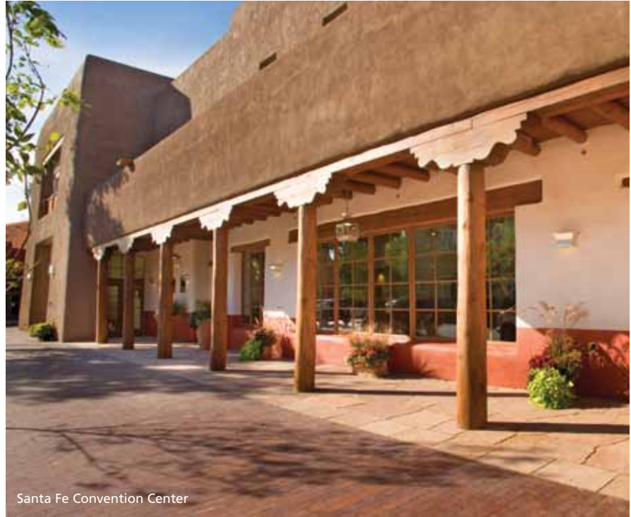
Santa Fe Convention Center

Some things are just more interesting when they're tiny and intricate. You can find plenty of miniature models and figures at Tucson's newest attraction, the Mini-Time Machine Museum of Miniatures. The 15,560-sq.-ft. museum has a collection of more than 275 tiny houses and other enchanting collectibles depicting different lands and time periods, real or imagined. The museum also has one of the oldest miniature houses in the country: the Brooke Tucker house, a masterpiece of miniscule manufacturing, created in 1775. The museum hosts private events and meetings for groups and attendees with a wee sense of wonder. theminitimemachine.org